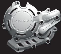
A - (1 pcs)