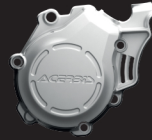
B - (1 pcs)